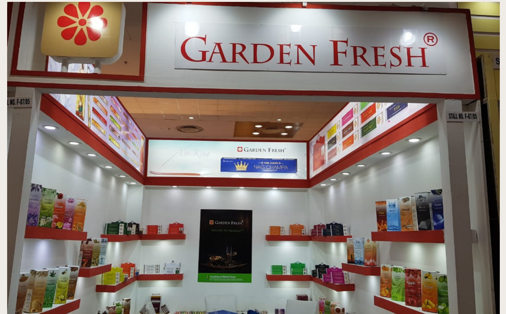
Spring Fair 2018