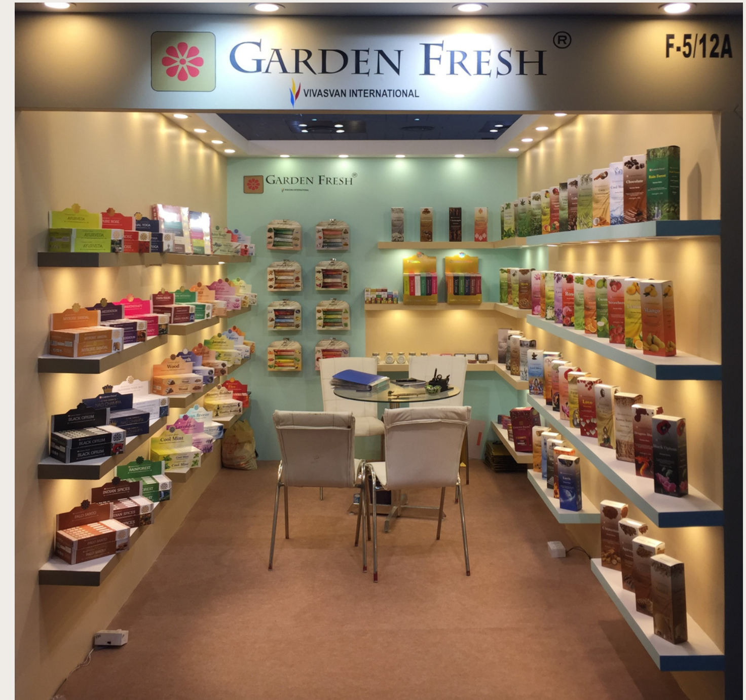
Spring Fair 2019