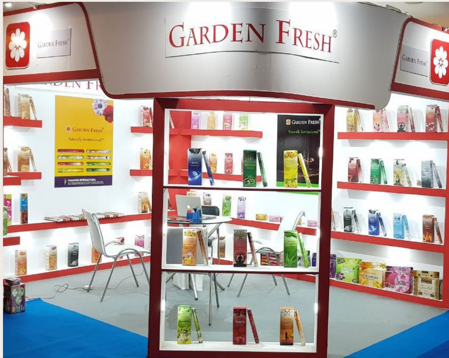
Autumn Fair 2017