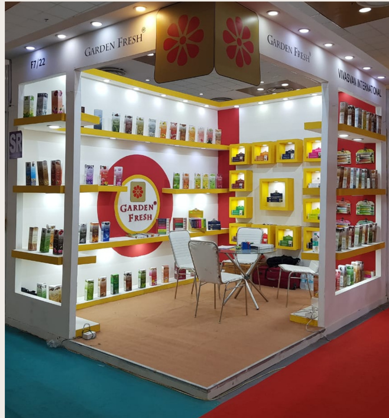
Autumn Fair 2018